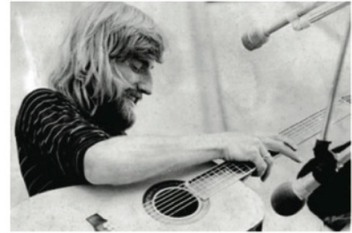
with Larrivee' Guitar #1 - 1972