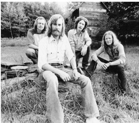
Lazarus II - Woodstock 1973